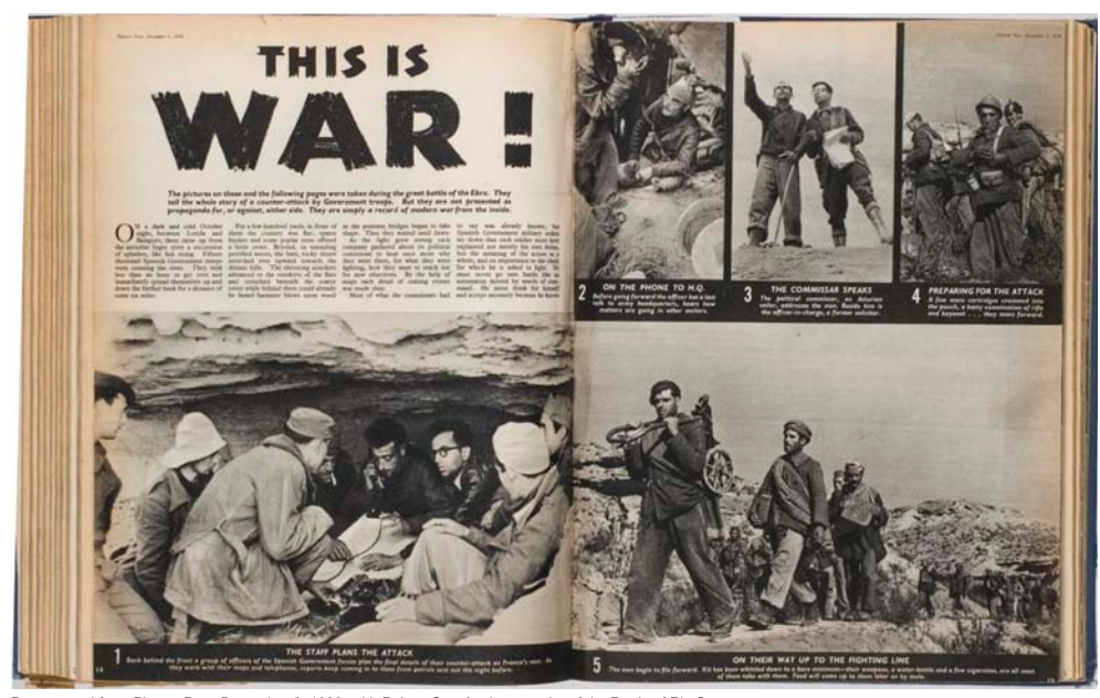
Page spread from Picture Post , December 3, 1938, with Robert Capa's photographs of the Battle of Rio Segre International Center of Photography